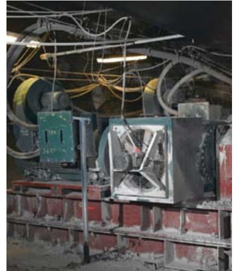
For this installation, an electric cooling fan is utilized to optimize performance. The fan is designed to maximize cooling of the reducer so it runs longer and requires less maintenance.

In this underground application, mining officials chose to use the parallel shaft configuration for a tandem conveyor drive.