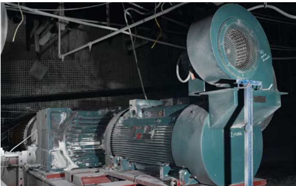
A 700k MagnaGear XTR reducer is connected to a 700 HP Baldor•Reliance® Mining Industry motor in this underground mining application. The tough construction, plus the bearing and seal designs of this motor, makes it ideal for harsh mining conditions. The blower keeps the motor cool across its entire operating speed range.

The reducer is available in a variety of horsepowers and sizes to fit most applications. Sizes 390k and below offer a solid or hollow shaft output. The hollow shaft option features a patented twin-tapered bushing system that provides easy-on/easy-off mounting and minimizes wobble for longer life.